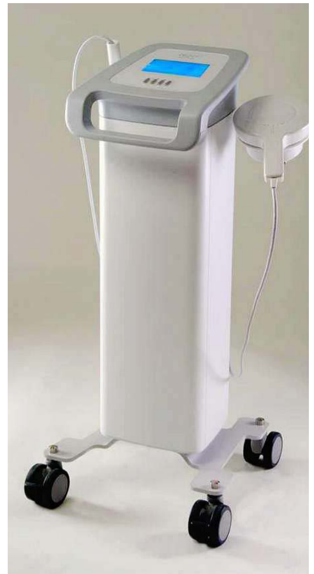
The Apollo system offers a unique design to treat orange peel skin and localised fat deposits in wide body areas. It can also be used for confined areas such as the face, neck and arms.

Very attractive offers await the first 20 customers who sign up for package deals. For details, call 1-300-88-8826, e-mail info@cnbeauty.com.my.