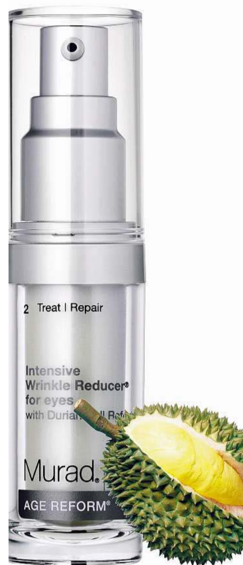
Durian Cell Reform derived from Asia's super fruit, boosts the performance and penetration of this advanced anti-aging formula.

For more information on Murad products, call info line 1-300-88-8826 or email to info@cnbeauty.com.my . Also visit www.cnbeauty.com.my