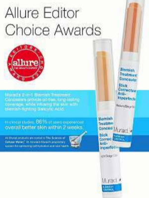
The Blemish Treatment Concealer.

The kit, which has now successfully helped millions take control of their acne, features Murad's Clarifying Cleanser, Exfoliating Blemish Treatment Gel, Skin Perfecting Lotion and Blemish Spot Treatment. With 90% of all users