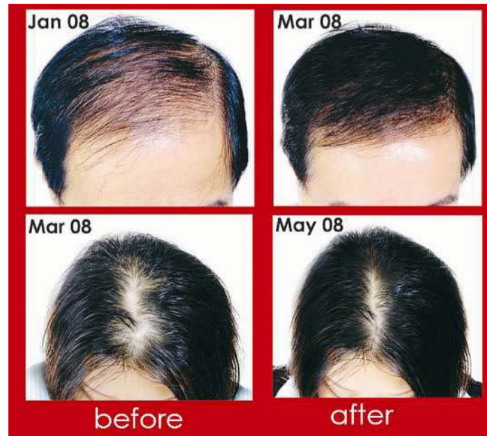
Miracle Hair Expert's satisfied customers have seen significant results after undergoing treatment.

For details, visit www.miraclehairexpert.com